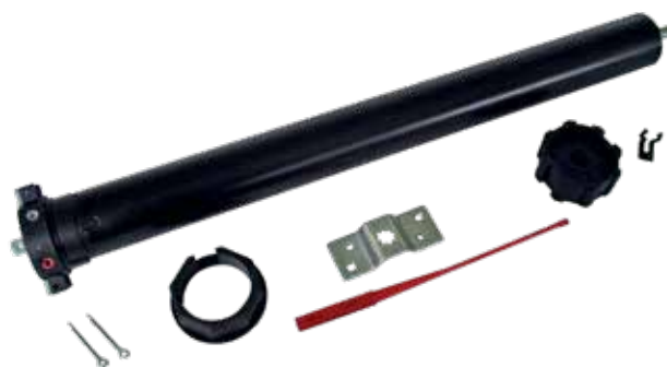
JOY SS Ø45mm