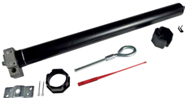
JOY CS Ø45 mm